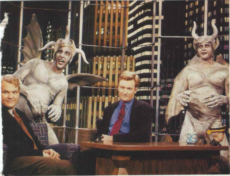
Conan and sidekick Andy Richter encounter a couple of gremlins

scanning the hyperlinked headlines that range from “Is there a ‘Late Night’ drinking game?” to “Where did Conan go to college?” and “Is there a Conan comic book?” He does have an occasional quibble—“Don’t let my girlfriend see that!” he cries when his current relationship is described as “not serious” (the note has since been removed)—but generally, he says, the information is right on the mark. There’s a strange interlude as O’Brien reads an entry aloud: “‘Why was Conan so nervous early in the show?’ You try replacing David Letterman—hey, that’s what it says! ‘You try replacing David Letterman.’ This is great! It’s eerie, though.”