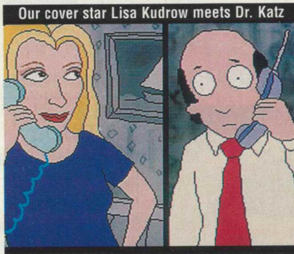
Our cover star Lisa Kudrow meets Dr. Katz

It's the kind of thing that would make Sigmund Freud rotate at 78 rpm, but thanks to relentless advances in modern technology, it is actually possible to receive intensive psychotherapy via e-mail. Whether or not this works is debatable—heck,